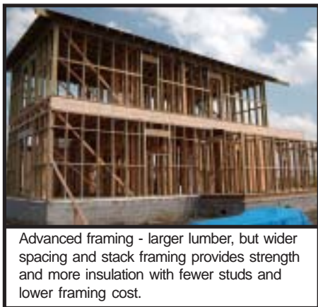
Advanced framing - larger lumber, but wider spacing and stack framing provides strength and more insulation with fewer studs and lower framing cost.